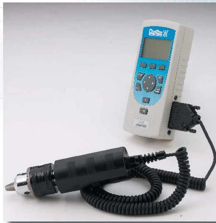
DFS-R shown with STS Series torque sensor.